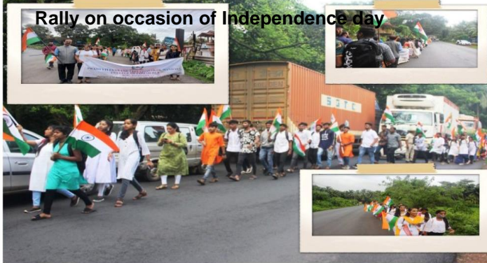
Rally on occasion of Independence day