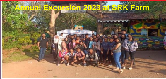
Annual Excursion 2023 at SRK Farm