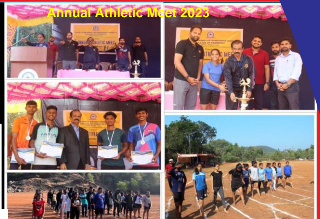
Annual Athletic Meet 2023