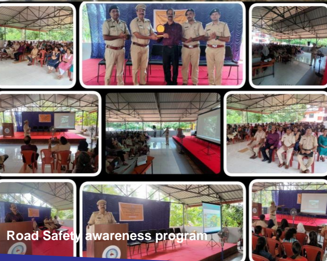
Road Safety awareness program