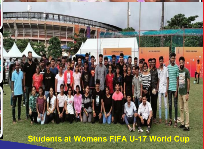
Students at Womens FIFA U-17 World Cup