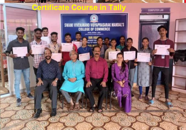
Certificate Course In Tally